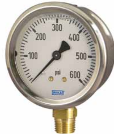
Bourdon Tube Pressure Gauge Model 21X.53