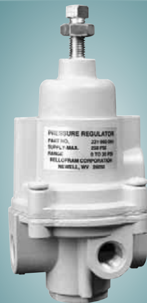
Type 40 Pressure Regulator Series